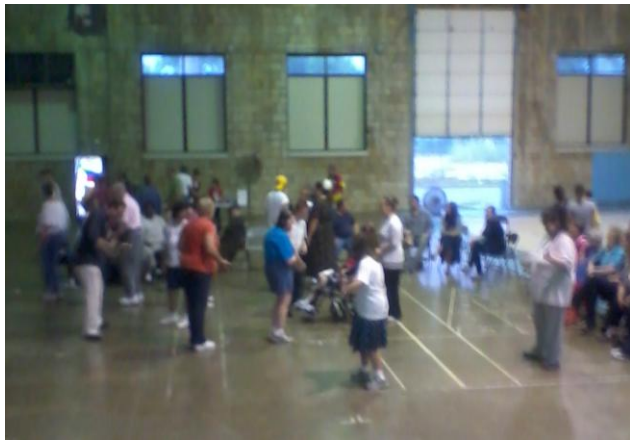
Look at them DANCE!