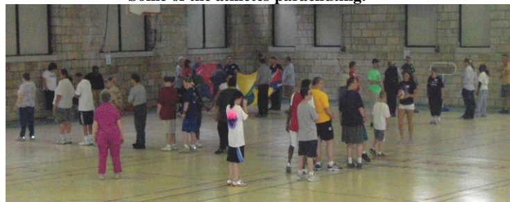
Look at all those athletes!