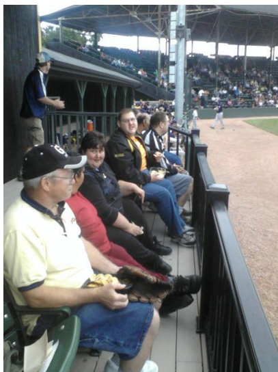
A group from MCSDD enjoys a night at the ballpark thanks to Hannibal Regional Medical Group who donated seats in their suite. In spite of a Cavemen loss, everyone had a good time at the game.

The CI consumers spent a night going out to the ballgame. June 23rd the consumers were treated to a night at Clemmons Field. They enjoyed watching the Cavemen play against the River Rats. They enjoyed being in a suite and having the waitress come to them to order snacks. A very special thanks is extended to the Hannibal Regional Medical Group for providing the tickets for this event.