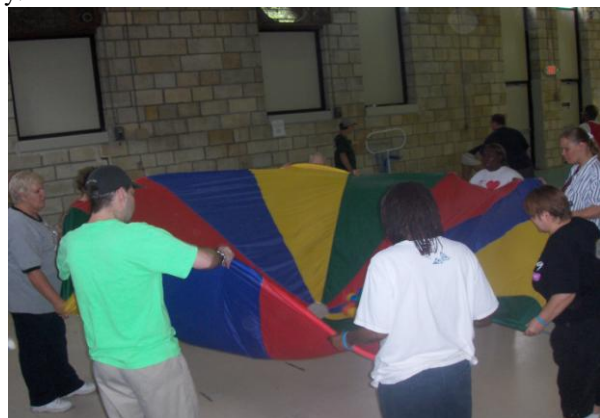
Some of the athletes parachuting.