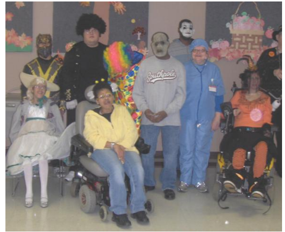
Bridges consumers participate in a Halloween costume contest.

Our sights have now turned toward the holiday season. In October we had our annual Halloween party, which was a lot of fun. We played games, ate some sweets, had a costume contest, and even danced the "Monster Mash" a few times.